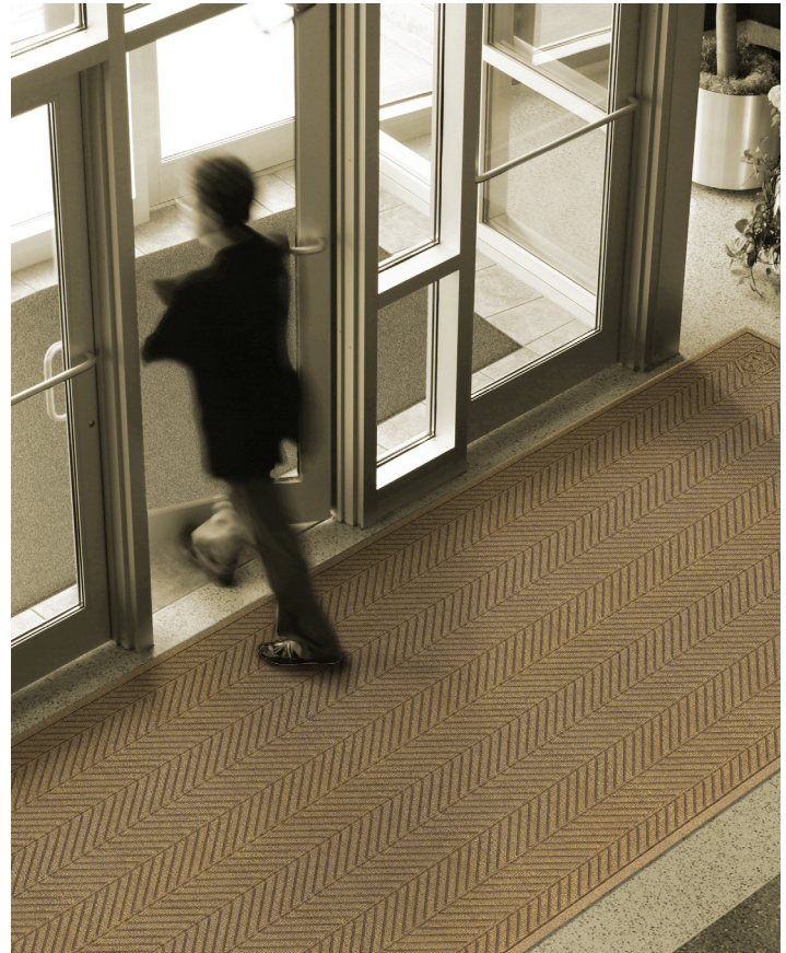
Classic Rubber Border

Mat sizes are approximate as rubber shrinks and expands in conjunction with temperature and time. Tolerable manufacturing size variance is 3-5%.