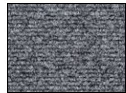
#27 DARK GREY