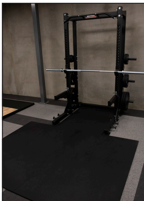
RUBBER WITH INSERT