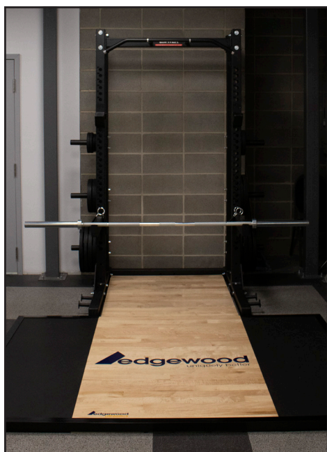
STANDARD/PREMIUM WITH INSERT