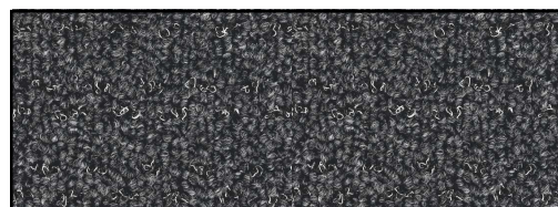
#27 BLACK GREY